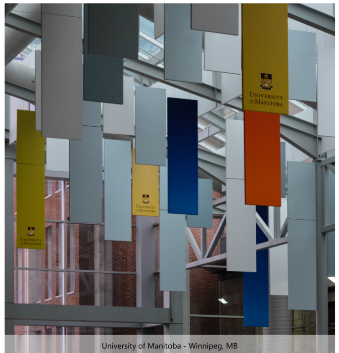
University of Manitoba - Winnipeg, MB

For more information, please contact Rieger Architectural Products www.rapl.ca or info@rapl.ca