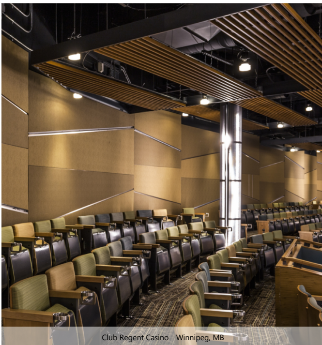
Club Regent Casino - Winnipeg, MB