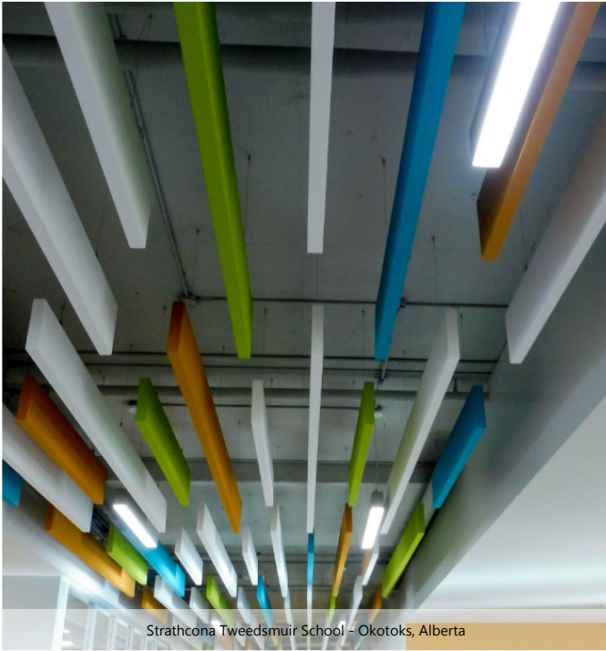
Strathcona Tweedsmuir School - Okotoks, Alberta

soundconcepts Making your ideas resonate